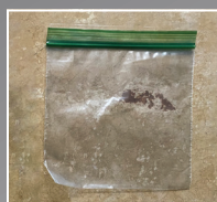
Plastic sandwich bag