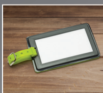
Reusable plastic tag holder