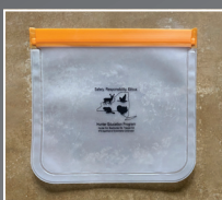
Reusable sandwich bag